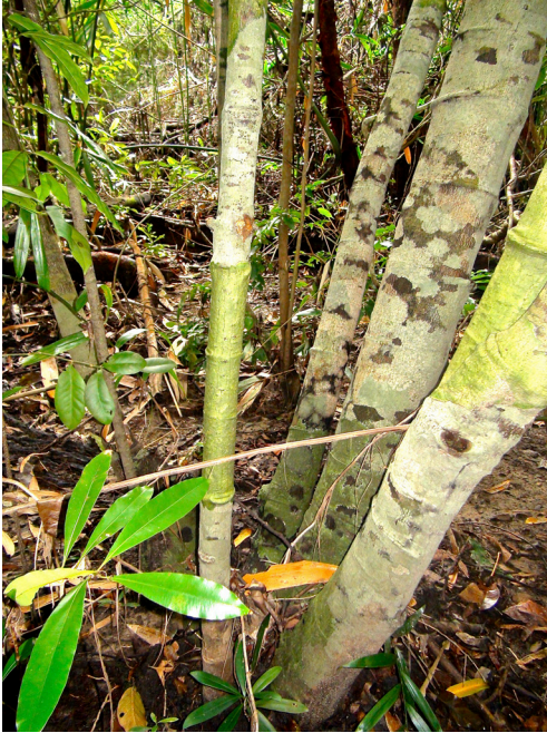
Fig. 3. Multi stemmed trunk of Gnetum gnemon in lowland riparian rainforest on Mua Island.

& J.T.Waterh., Maranthes corymbosa Blume, Melaleuca dealbata S.T. Blake and Syzygium angophoroides (F.Muell.) B.Hyland with a sharp ecotone to the surrounding woodland vegetation.