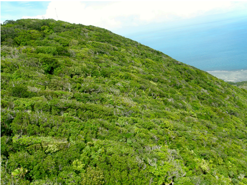
Fig. 2. Upland habitat of Gnetum gnemon on Banks Peak, Mua Island.

in the north-east, rising to 376 m. A rugged east and south facing coastline features rocky coastal headlands, and an expansive coastal plain forms a broad enclave behind the island's north-eastern coastline. Vegetation is diverse with a total of 62 vegetation communities occurring within 23 broad vegetation groups and 44 regional ecosystems. The flora is the richest in the Torres Strait region with 609 native species, comprising 19 ferns, one cycad, two conifers and 654 flowering plants (3D Environmental 2012a).