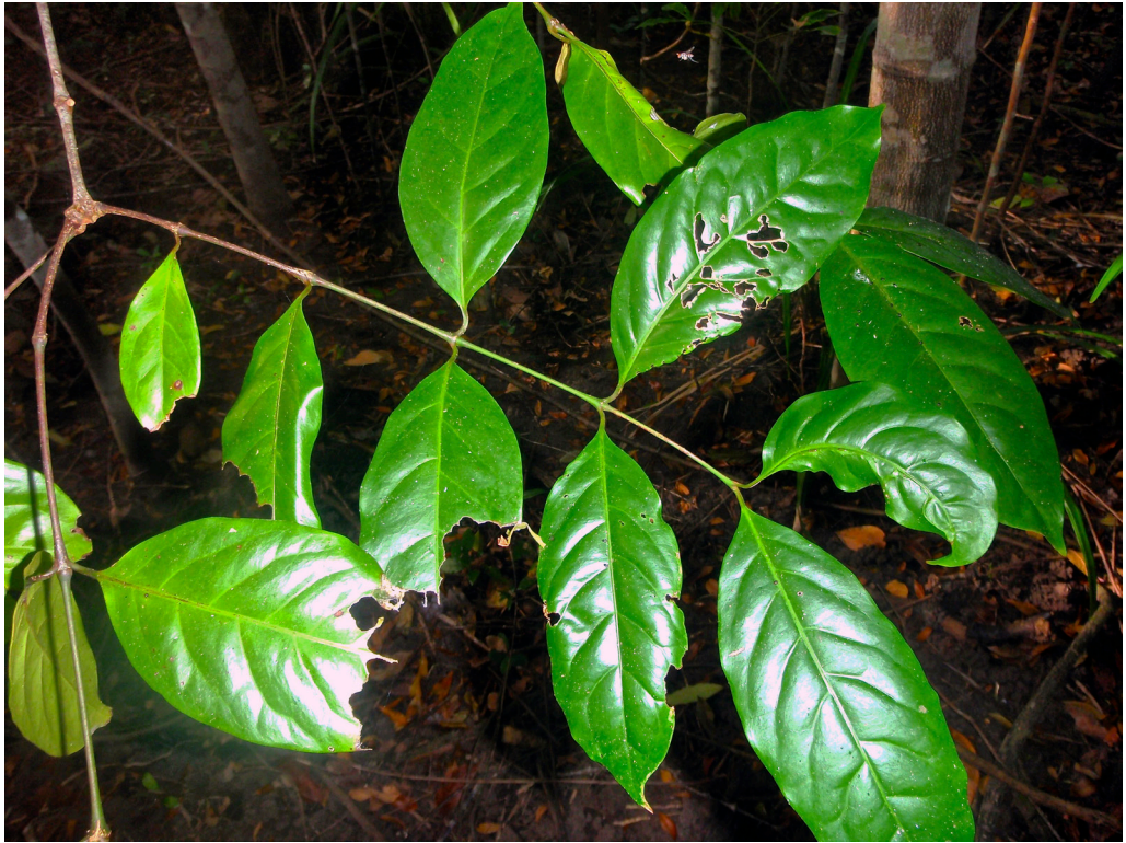
Fig. 1. Leaves of Gnetum gnemon on Badu Island (Fell 10206 & Stanton).