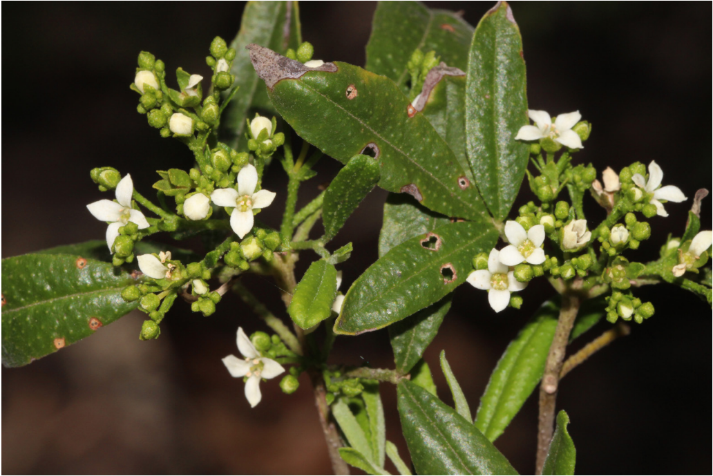
Fig. 2. Zieria abscondita . Flowering branchlet (Forster PIF45381 & Leiper, BRI).