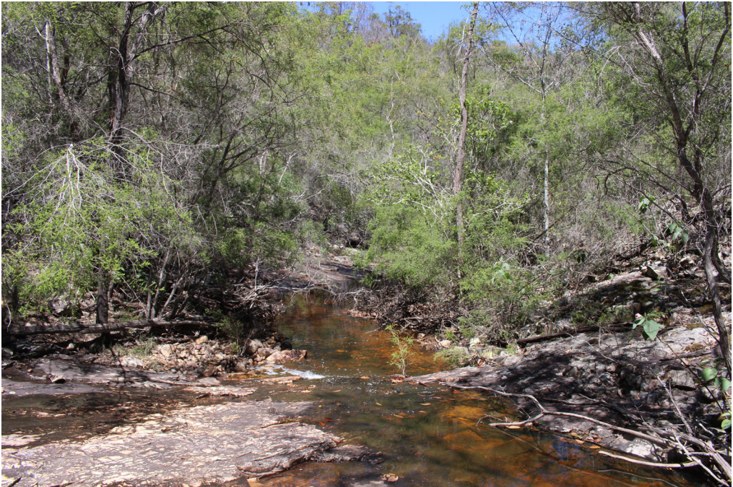
Fig. 3. Habitat of Zieria abscondita (Forster PIF45381 & Leiper, BRI).