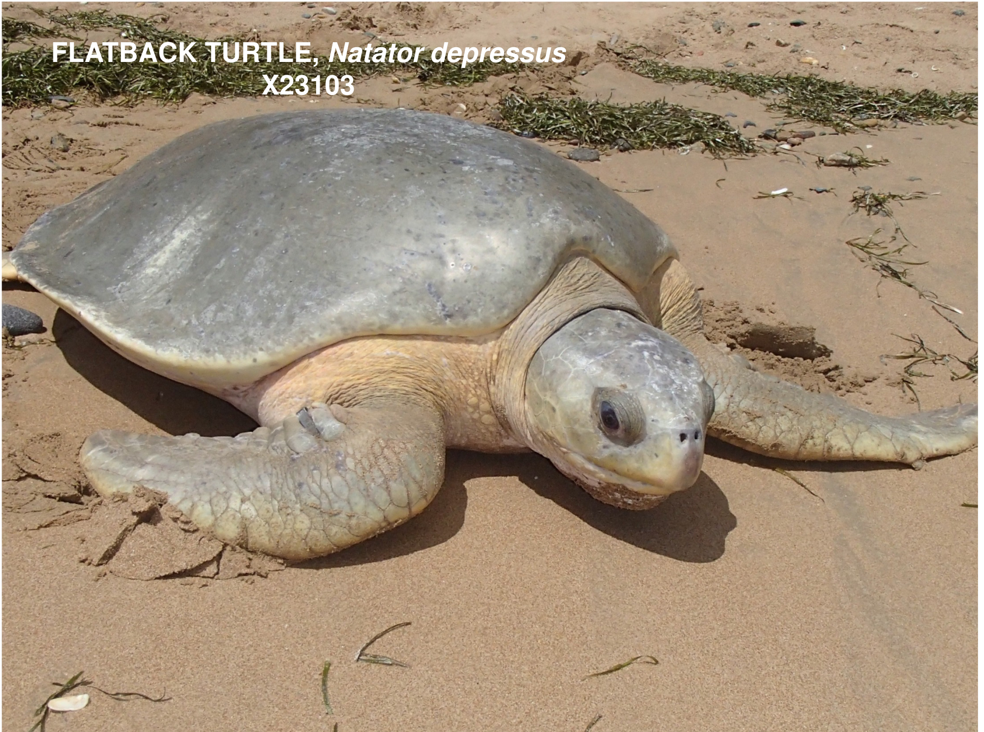
FLATBACK TURTLE, Natator depressus X23103