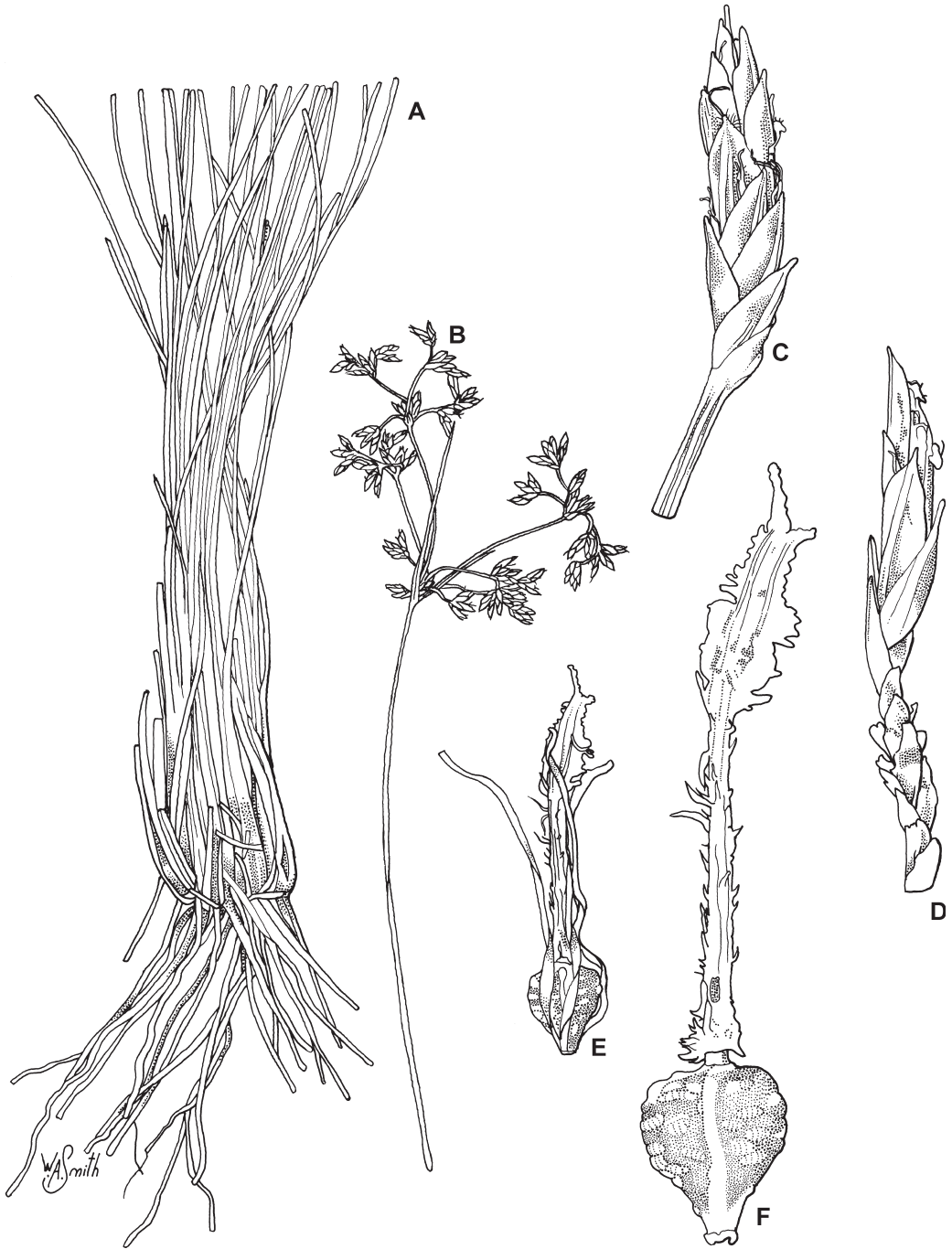
Fig. 1. Fimbristylis buchananensis . A. base of plant \times 0.6 . B. inflorescence \times 0.8 . C. spikelet \times 8 . D. spikelet with rachilla \times 8 . E. achene with filaments, style and stigmas \times 16 . F. achene with style and stigmas \times 32 . A & B from Kemp 3380H (BRI); C–F from Neldner & Thompson 3362 (BRI). Del. W. Smith.