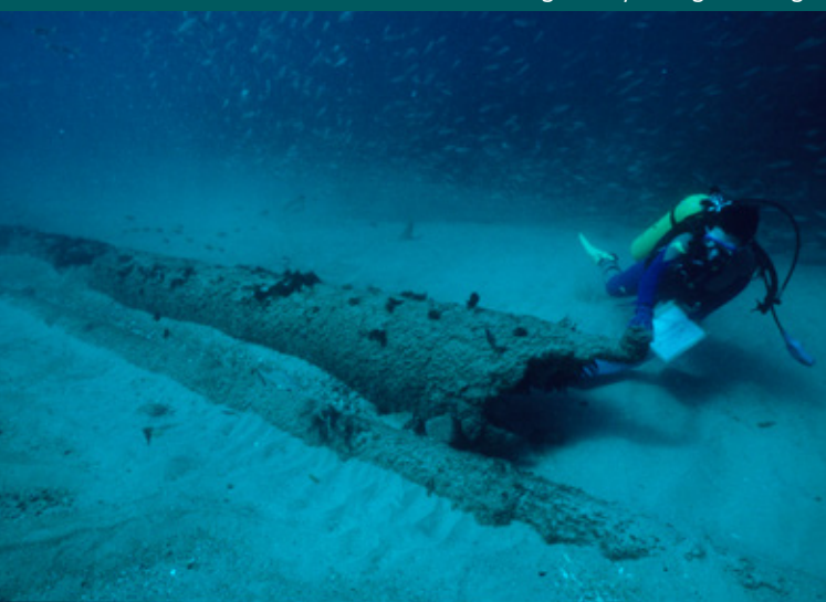
▼ Diver inspecting wreckage