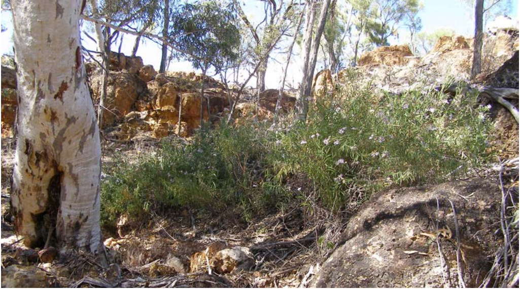
Fig. 2. Olearia bella . Colony of plants in habitat, Araluen Station, Queensland, August 2011.