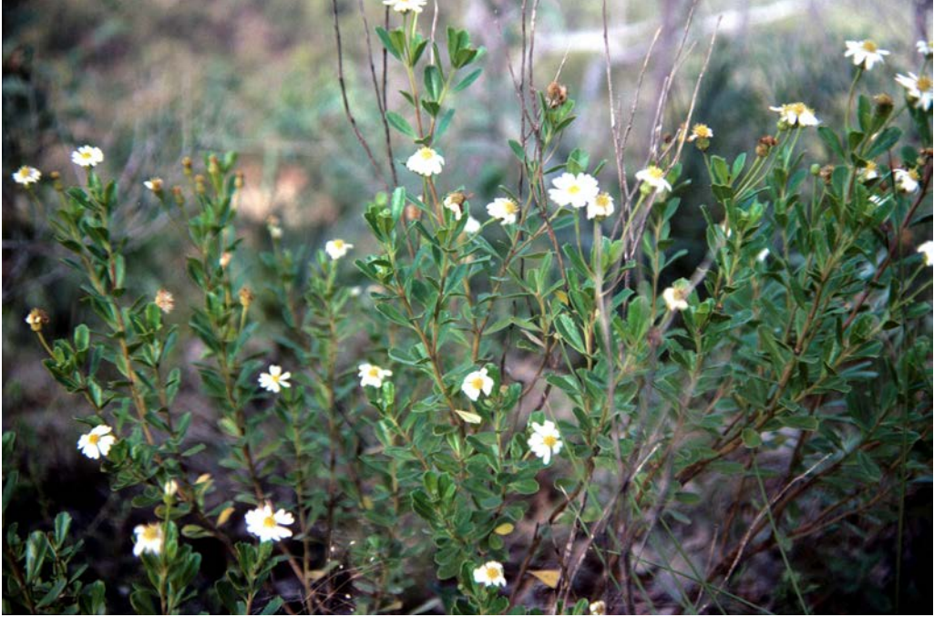
Fig. 5. Olearia orientalis. Flowering plant, Glen Geddes, Queensland, July 1989.