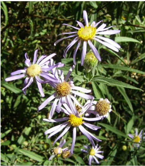
Fig. 3. Olearia bella . Flowering plant, Araluen Station, Queensland, August 2011.

becoming glabrous, or sometimes glabrous, or very rarely with erect eglandular hairs to 0.05 mm; oil glands often present on ribs of glabrous stems. Leaves alternate, narrowly-lanceolate to lanceolate, rarely oblanceolate, 40–80 × 6–22 mm (4.2–8.6 times longer than broad), base attenuate, oil glands present on lamina, apex acute; margins denticulate mostly in upper two-thirds, rarely with teeth in lower third, or rarely entire, teeth 0.05–0.8 mm long; venation visible throughout, mostly penninerved, upper leaf nerves looped and almost parallel to mid-rib; indumentum of sessile to erect glandular hairs, rarely with scurfy hairs on juvenile leaves, often becoming glabrous with age; sparse to moderately dense on both surfaces, appearing glabrous with age, older leaves occasionally with a pruinose bloom. Capitula in terminal corymbose clusters of 2–5, pedunculate, radiate, 15–20 mm long, 19–27 mm diameter. Peduncles 18–73 mm long, with a few slender leaf-like bracts along their length. Involucral bracts 40–60, graduated in length, 4–5-seriate, outer surface with sessile glandular hairs, margins entire but appearing dentate due to white, yellow or brown stiff erect to appressed hairs, not membranous, apex acuminate;