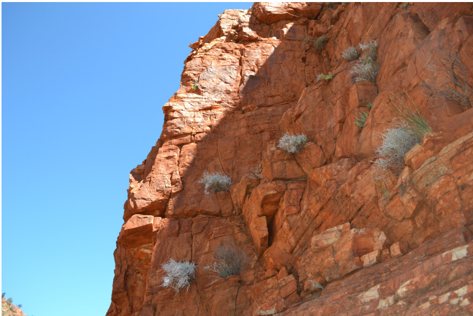
Fig. 2. Habit of Ptilotus royceanus (Jobson 10779 & Davis, NT).