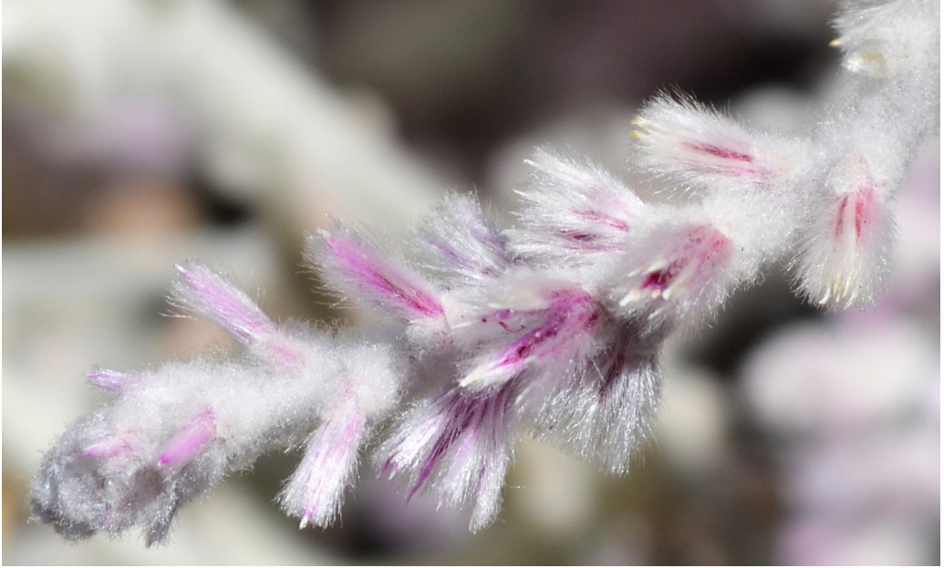
Fig. 1. Inflorescence of Ptilotus royceanus (Jobson 10779 & Davis, NT).