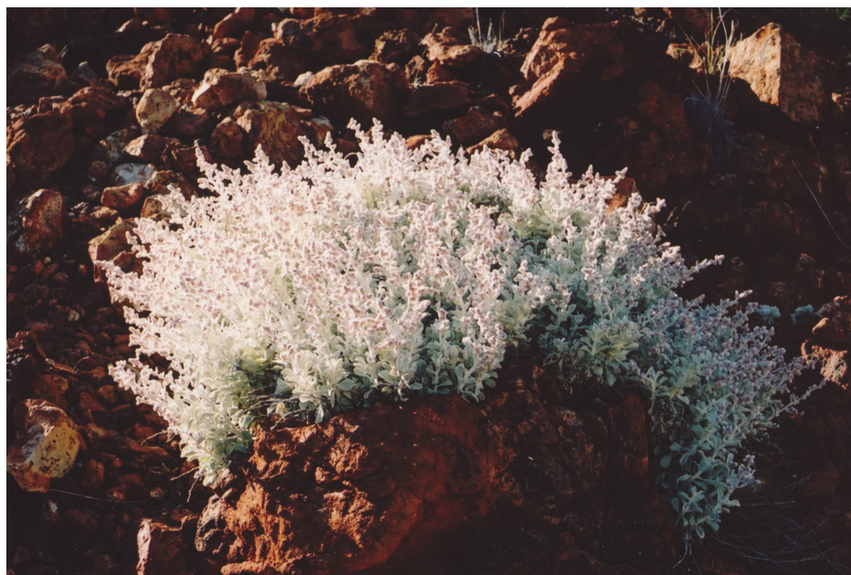
Fig. 4. Habit of Ptilotus mollis ( van Leeuwen 4845 , PERTH).