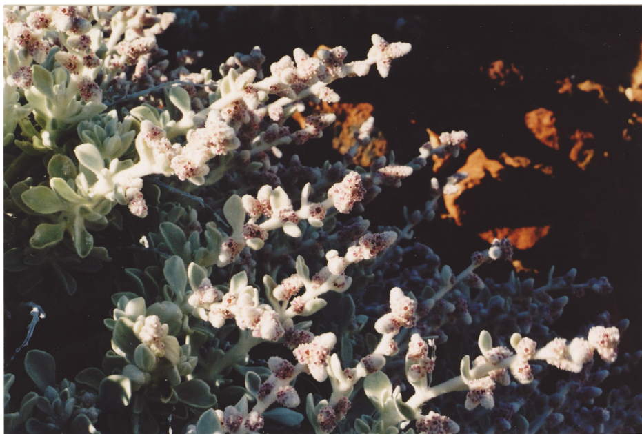
Fig. 3. Inflorescences of Ptilotus mollis ( van Leeuwen 4845 , PERTH).