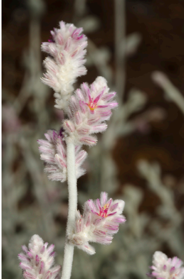
Fig. 5. Inflorescence of Ptilotus maconochiei (Purdie 8598, CANB).

royceanus rarely have flowers that are loosely compact (especially towards the apex) and not as elongated and pendulous as is usual, but are none the less distinct from those in Queensland in that the rachis is clearly visible between the flowers.