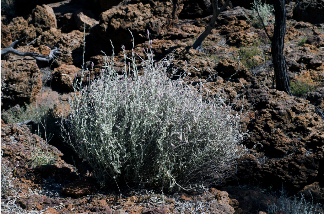
Fig. 6. Habit of Ptilotus maconochiei (Purdie 8598, CANB).

wide. Staminal cup symmetrical, not lobed, 0.6–0.8 mm long, glabrous. Ovary obovoid, pink, 0.9–1.4 mm long, 0.8–1.2 mm wide, densely villous with straight nodose hairs. Style straight, 1.6–2 mm long, centrally fixed on the ovary. Stigma unlobed, capitate. Fruit smooth, membranous. Seed glossy, black, 1.2–1.3 mm long, 0.9–1 mm wide. Figs. 5 & 6.