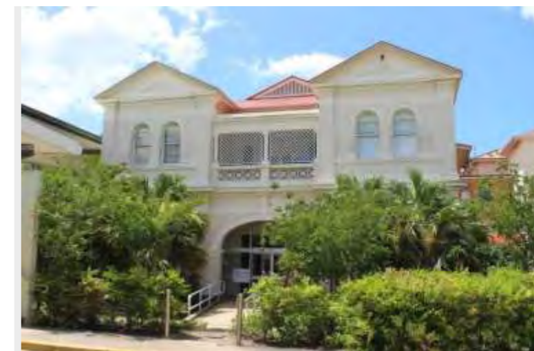
Southern elevation of Centre-Block.