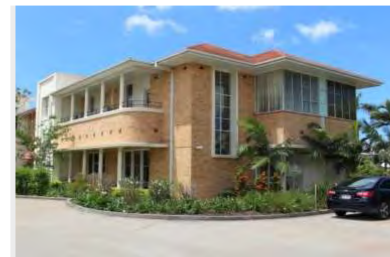
South-western corner of E-Block.