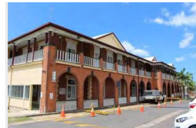
Southern elevation of Old Quarters.