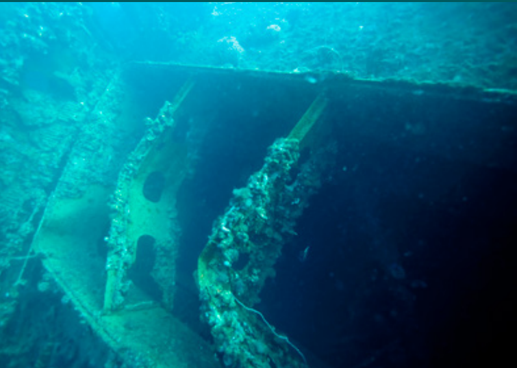
▼ The exposed engine