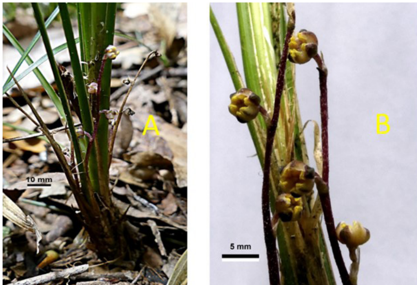
Fig. 2. Male plants of Lomandra phillipsiorum . A. inflorescences. B. flowers. A & B from Phillips 2629 & Phillips (BRI).