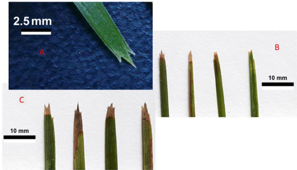
Fig. 1. Leaf tips of Lomandra phillipsiorum . A. young male leaf tip. B. mature male leaf tips. C. mature female leaf tips. Scales as indicated. A from Phillips 2722B & Phillips (BRI); B from Phillips 2719 & Phillips (BRI); C from Phillips 2718 & Phillips (BRI).