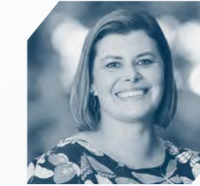
The Honourable Nikki Boyd MP

This commitment is part of the Government's broader plan to deliver a world-class, innovative and inter-connected disaster and emergency management system to keep Queenslanders safe in times of natural disasters or emergencies.