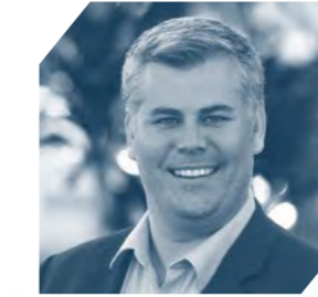
The Honourable Mark Ryan MP

We pay our respects to Elders past and present and acknowledge their significant and ongoing connection to the lands and waterways on which we live and work.