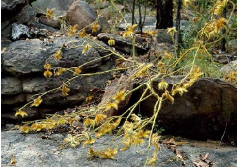
Fig. 4. Plant of Solanum ultraspinosum (Telford 8116, CANB).

purple, inner surface glabrous, outer surface lacking prickles. Male flowers: inserted along rachis, rachis 20–280 mm long, bearing 9–23 flowers; pedicels at anthesis 11–16 mm long, prickles present; calyx tube at anthesis 1.5–2.5 mm long; calyx lobes attenuate, 4.5–8 mm long; calyx prickles 50–110, 1.5–4.5 mm long; stellate hairs moderately dense to very dense, yellow or transparent, 0.35–0.8 mm across, stalks 0–1.1 mm long, lateral rays 5–8; central ray 0.8–1.8 times as long as laterals; corolla 10–13 mm long, inner surface glabrous or with a patch of simple hairs at each lobe apex; anthers 6.5–7.5 mm long; filaments 0.5–1 mm long; ovary glabrous. Bisexual flower: inserted at base of rachis; pedicels at anthesis 16–26 mm long; calyx prickles 180–250, 1.5–10 mm long; stellate hairs dense, transparent to yellow, 0.4–0.9 mm across, stalks 0–0.9 mm long, lateral rays 4–8; central ray 0.7–1.3 times as long as laterals; corolla 13–21 mm long, inner surface glabrous; style 13–16 mm long, glabrous; ovary glabrous. Fruits solitary, globular, 17–28 mm diameter, white at maturity, calyx tube not accrescent; calyx lobes exceeding mature fruit, strongly recurved; prickles 190–310, 1.5–12 mm long; pedicels 25–40 mm long; seeds black, 2.7–3 mm long.