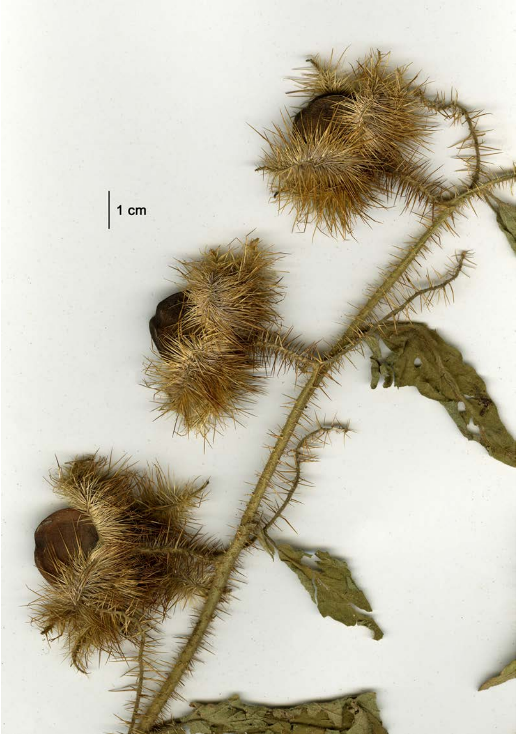
Fig. 3. Fruiting calyces of Solanum ultraspinosum (Egan 4569, DNA).