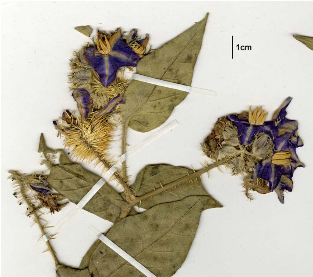
Fig. 2. Portion of the holotype of Solanum apodophyllum , showing inflorescences.

1–10 on midvein only, straight, broad-based; stellate hairs moderately dense to dense, 0.2–0.35 mm apart, 0.5–0.8 mm diameter, stalks 0–0.15 mm long; lateral rays 7–8, porrect or ascending; central ray 0.5–0.9 times as long as laterals. Inflorescence supra-axillary, cymose (pseudo-racemose), common peduncle absent, rachis prickles present, with one bisexual flower at base of rachis, the rest male. Flowers 5-merous; corolla rotate, purple, inner surface glabrous, outer surface lacking prickles. Male flowers: inserted along rachis; rachis 52–88 mm long, bearing 10–15 male flowers; pedicels at anthesis 2.5–11 mm long, prickles present; calyx tube at anthesis 1–2 mm long; calyx lobes attenuate,