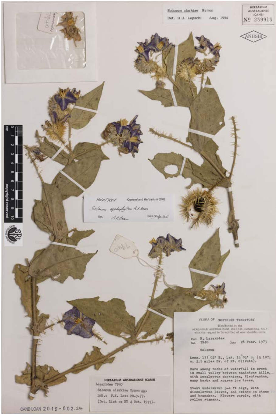
Fig. 1. Holotype of Solanum apodophyllum (CANB).