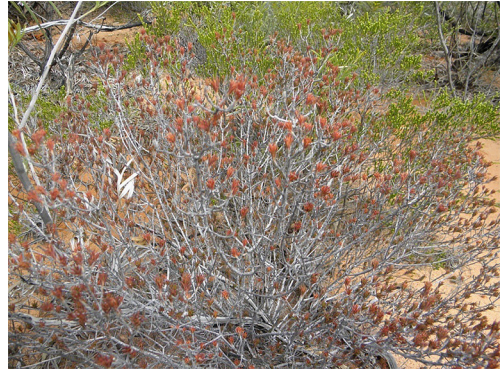
Fig. 5. Hibbertia ferox . Plant showing diallagy with Calytrix microcoma in background, Poison Valley Road, Burra Range (no voucher).