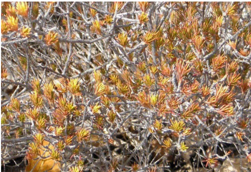
Fig. 4. Hibbertia ferox . Portion of plant showing diallagy developing, Poison Valley Road, Burra Range (no voucher).