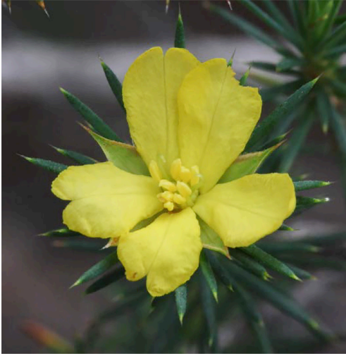
Fig. 2. Hibbertia ferox . Flower (Townsend s.n., JCT).