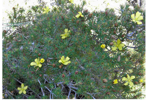
Fig. 3. Hibbertia ferox . Habit of flowering plant (Townsend s.n., JCT).